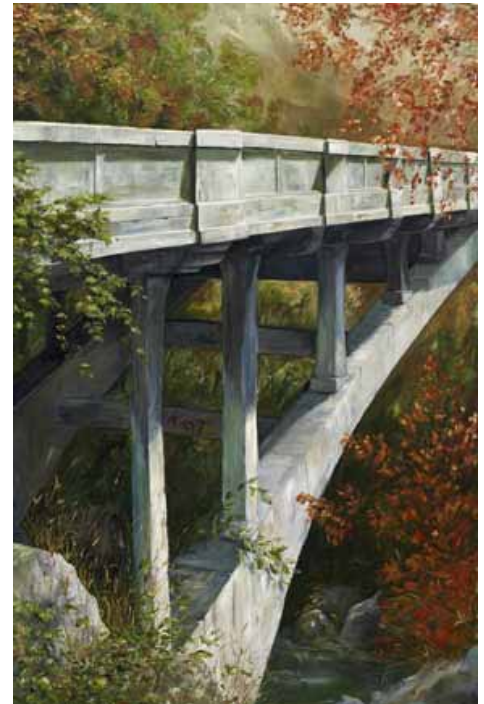
"The Orangevale Avenue Bridge," by Theresa Fike, is one of the paintings to be featured at the Folsom History Museum.

The Gallery at 48 Natoma will feature an exhibit from the Smithsonian Institution Traveling Exhibition Service, Covered Bridges: Spanning the American Landscape , from May 22 to July 15. The exhibition includes reproductions of a number of stunning photographs and drawings of surviving covered bridges, models of bridge trusses, and other objects. The Folsom Art Association will also display paintings of local bridge scenes in a separate exhibition in the art center. All exhibits are free and open to the public. For more information, call 355-7285.