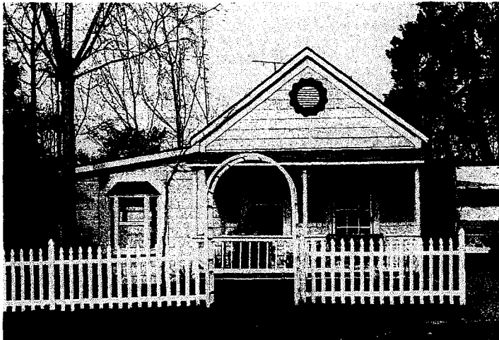
612 Figueroa – South Elevation