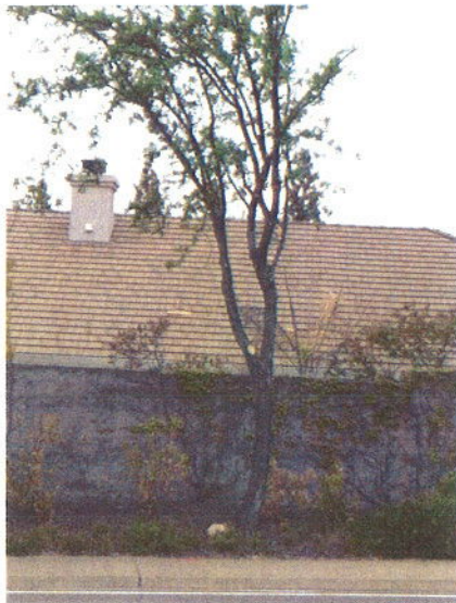
~Tree pruning in Los Cerros