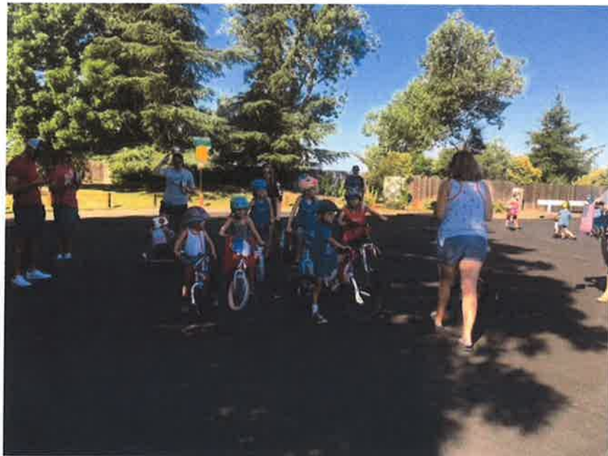
Many kids in our neighborhood - especially near the dead end at Steeplechase Mini Park.