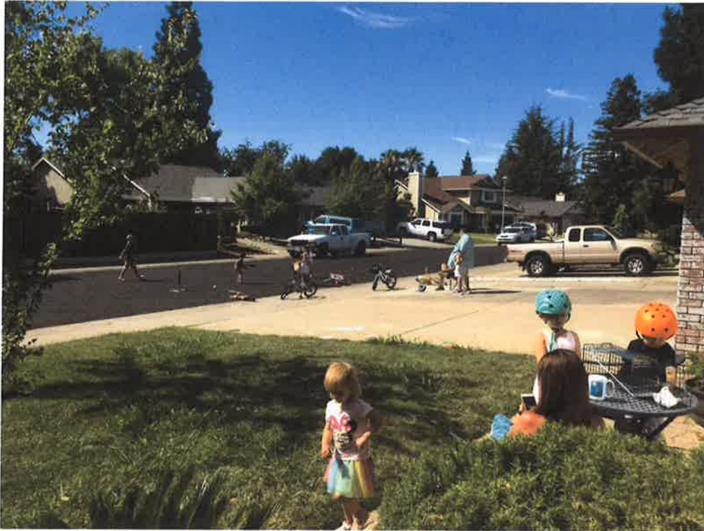
Typical scene on a nice day - kids out playing everywhere