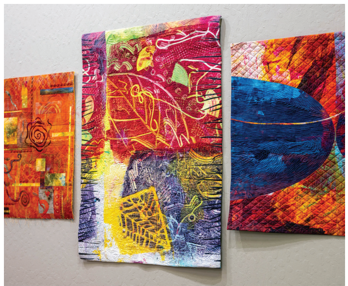
Artwork from the Feb/March exhibit, Art Movements in Fiber , at The Gallery at 48 Natoma