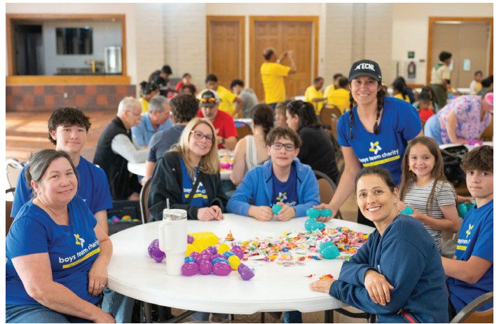
Dozens of volunteers gathered to stuff eggs for the 3rd Annual Festival of Eggs.