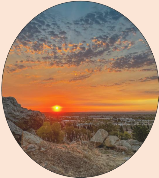
Golden Vista Park