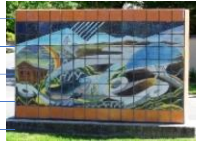
"Reflection" By: Yoshio Taylor

15 service pedestals (Power for lights + Irrigation)